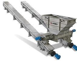
U-Trough Screw Conveyor