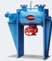
Vacuum & Drying