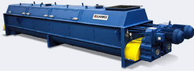
Pug Mill Continuous Mixer

Robust construction with a proven design to deliver superior, uniform mixing and blending. Batch, continuous, ribbon, paddle and custom agitator mixing designs are available.