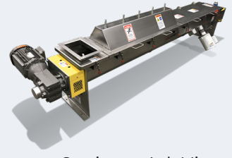
Continuous Lab Mixer