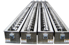
Stainless & Exotic Alloys