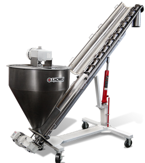
Split Tube Conveyor