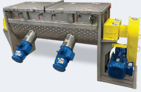
Thermal Heating & Cooling

S. Howes provides reliable and efficient industrial mixers to mix and blend biofuel and biomass feedstocks. Batch and continuous mixers are available in various configurations and are customized for each application.