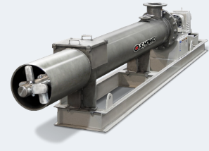
Continuous Simplex Mixer