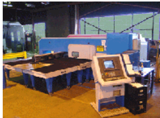
33 Ton CNC Turret Punch Press For Screen Production

We encourage our customers to make use of our Product Testing Laboratory where material processing can be observed and where we tailor the optimal solution for your unique products and processing needs.