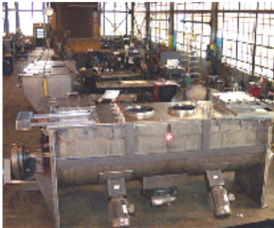
Sanitary Ribbon Blender Under Construction

The success of our company is best evidenced by the following facts: